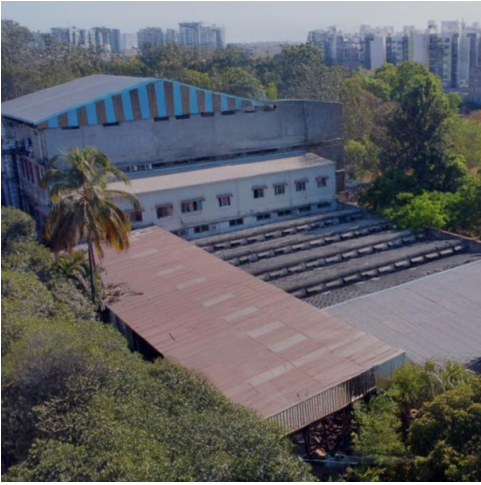
KPL HQ - BANNERGHATTA