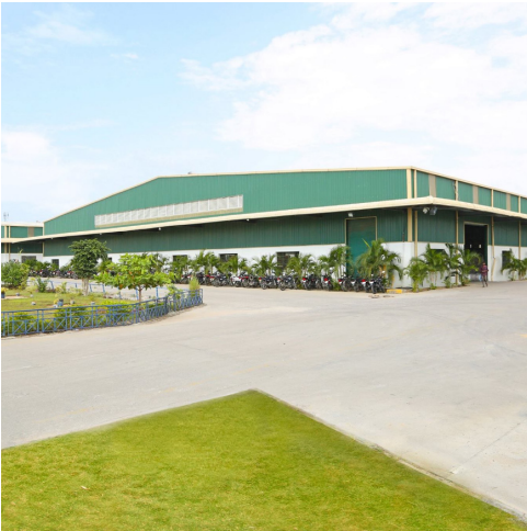
UNIT 5 - MADDUR