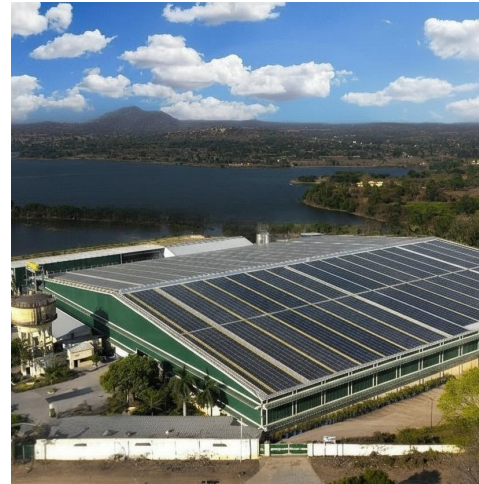
UNIT 7 - CHIKKABALAPUR