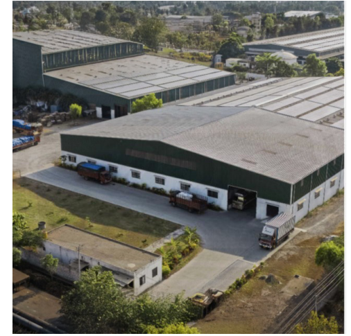
UNIT 4 - MADDUR