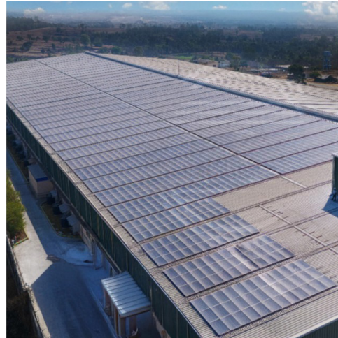
UNIT 6 - HASSAN