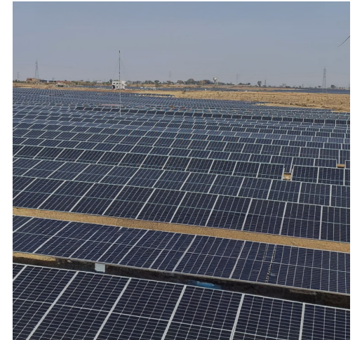
UNIT 8 - BASAVANA BAGEWADI