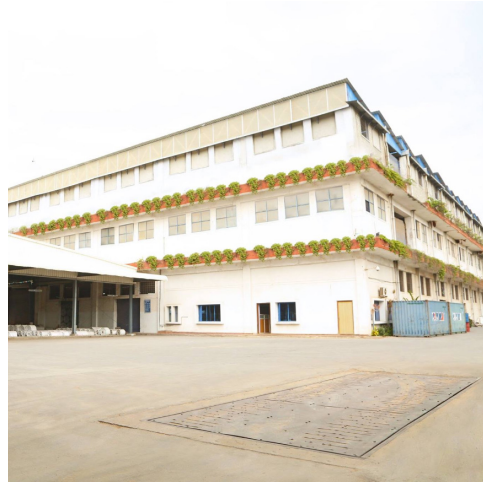
UNIT 2 - JIGANI INDUSTRIAL AREA