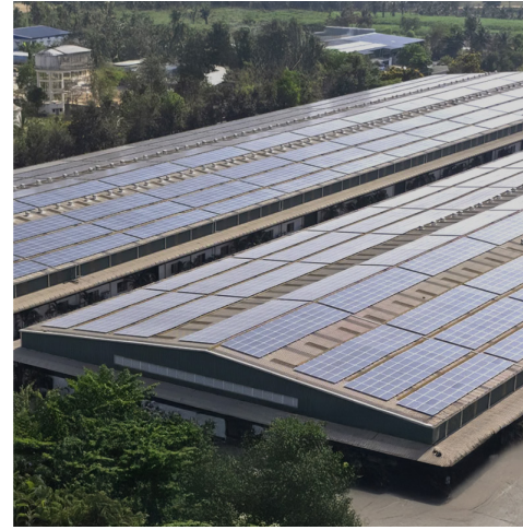
UNIT 3 - MADDUR